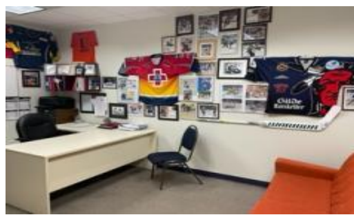
DOZENS OF SIGNED PICTURES, JERSEYS AND STICKS FROM FORMER PLAYERS ADORN ALL FOUR WALLS OF "DUNER'S OFFICE"