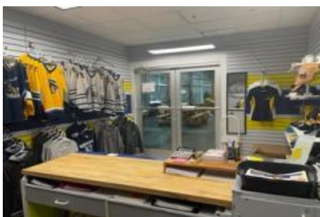
WRANGLERS' PRO SHOP VERY BUSY SHOP ON GAME DAYS!